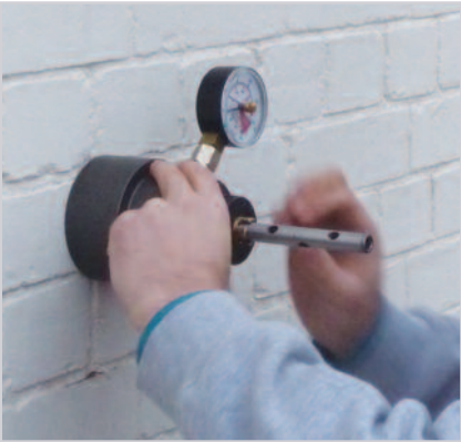
3. Slide the Load Test Unit (LTU) over the LTK and replace the cross pin, engaging it in the castellation on the top of the center stud