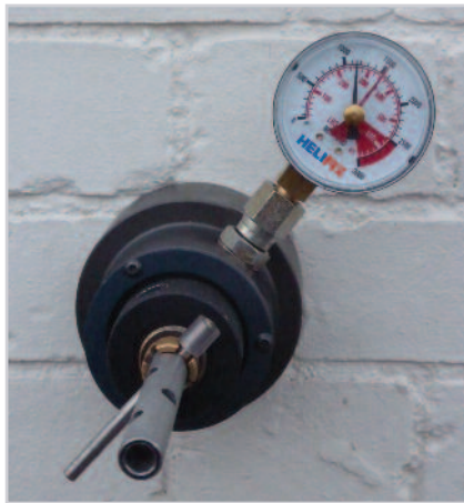
6. Note the reading and then release the tension on the tested wall tie