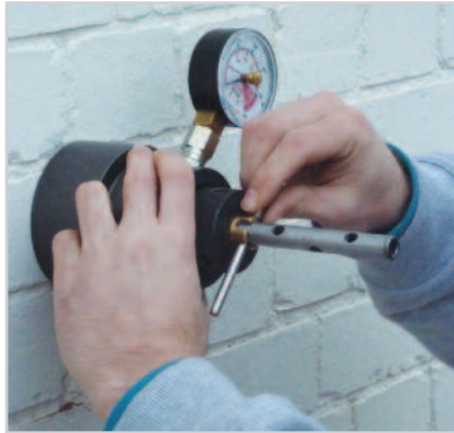
4. Place the cross pin through the LTK and take up the slack on the central nut