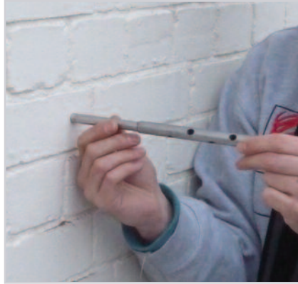
2. Fit the appropriate sized Load Test Key (LTK) at least 2" (normally one full turn) over the end of the tie. Remove the cross pin, if fitted