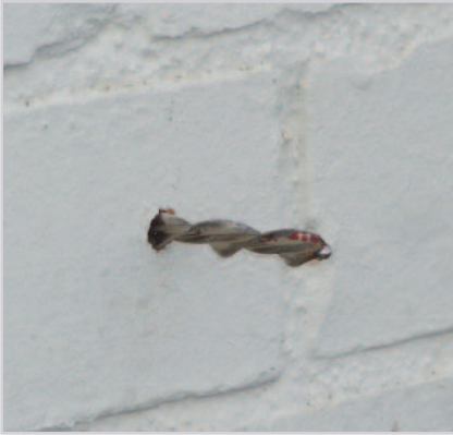
1. Install tie into inner or outer substrate