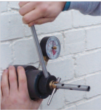
5. Turn the Tommy bar slowly until the proof or maximum load is achieved. DO NOT enter the red zone and DO NOT OVERLOAD